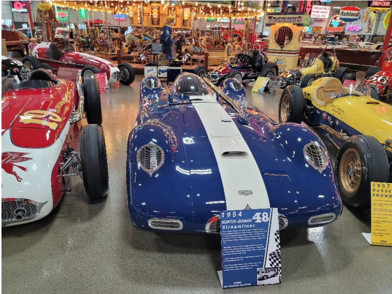
This streamliner ran the Indy 500 in 1954.