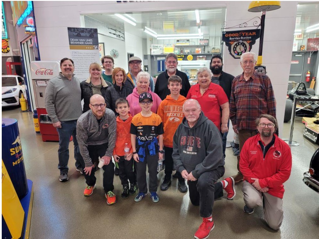
The happy group at the Ray Skillman car collection